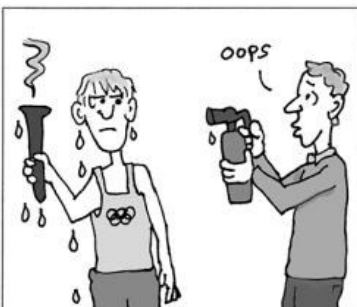
Use a "Type O" extinguisher to put out Olympic flames.

Class D Fires involve combustible metals, such as magnesium, titanium and sodium. These fires require a special extinguisher labeled D.